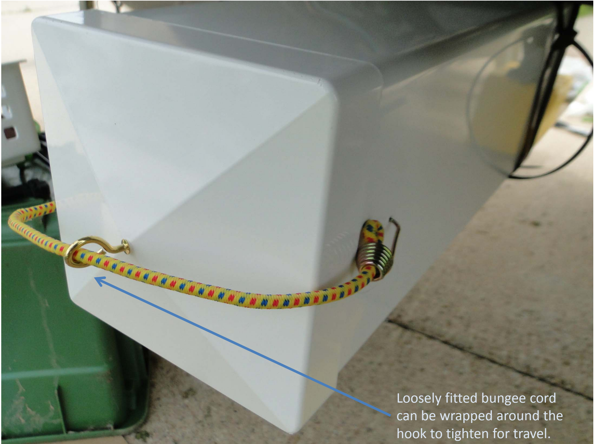
Loosely fitted bungee cord can be wrapped around the hook to tighten for travel.